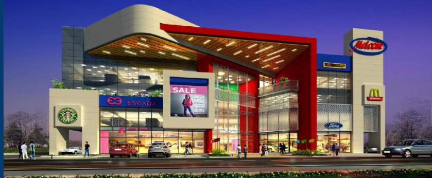
MELCOM MALL DZORWULU